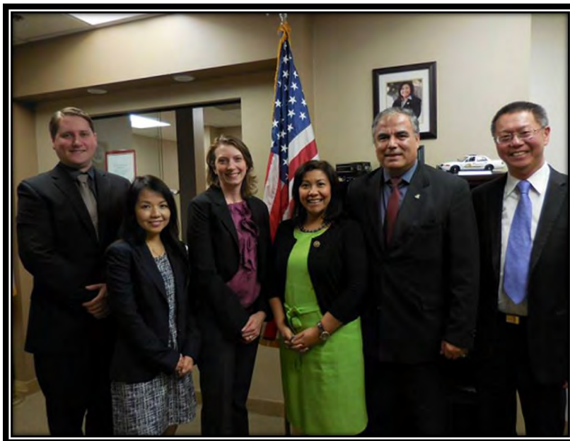
Another meeting with Congresswoman Norma Torres at the Inland Empire Section area to discuss all problems regarding transportation funding, public safety..ect.