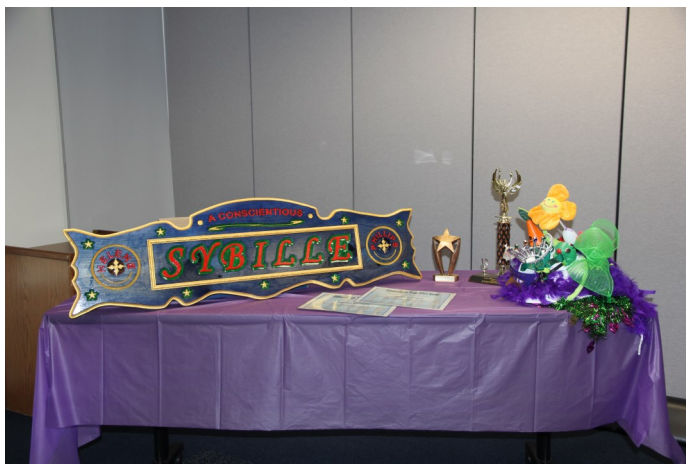
Gifts and Memorabilia at the retirement parties