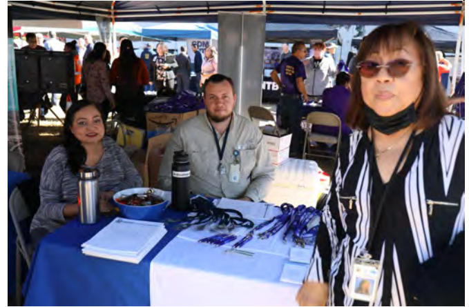
Above, IE Section members participate in the District 8 Innovation Fair in District 8, San Bernardino on October 25.. Below, a flyer promoting the event lists PECG as a sponsor.